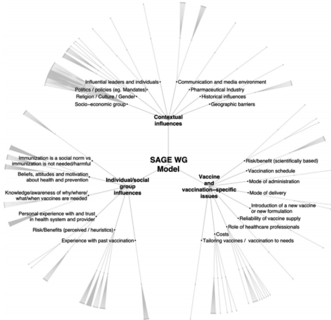
Fig. 1. The SAGE Working Group [WG] "Model of determinants of vaccine hesitancy".